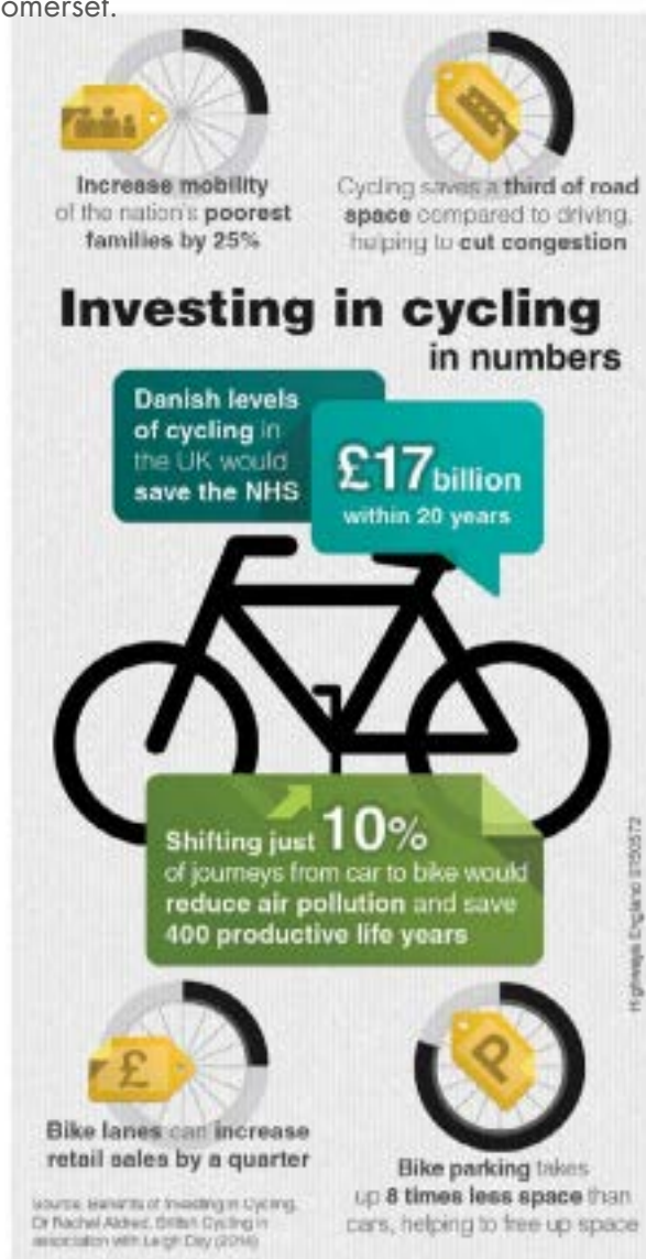
Figure 2.3: Effects of cycling investment

The negative effects of transport are more likely to affect people living in more deprived neighbourhoods and the effects of lack of access to transport particularly affect those in rural areas. This problem is even worse for lower income groups. People living in the least prosperous areas are twice as likely to be physically inactive as those living in more prosperous areas.