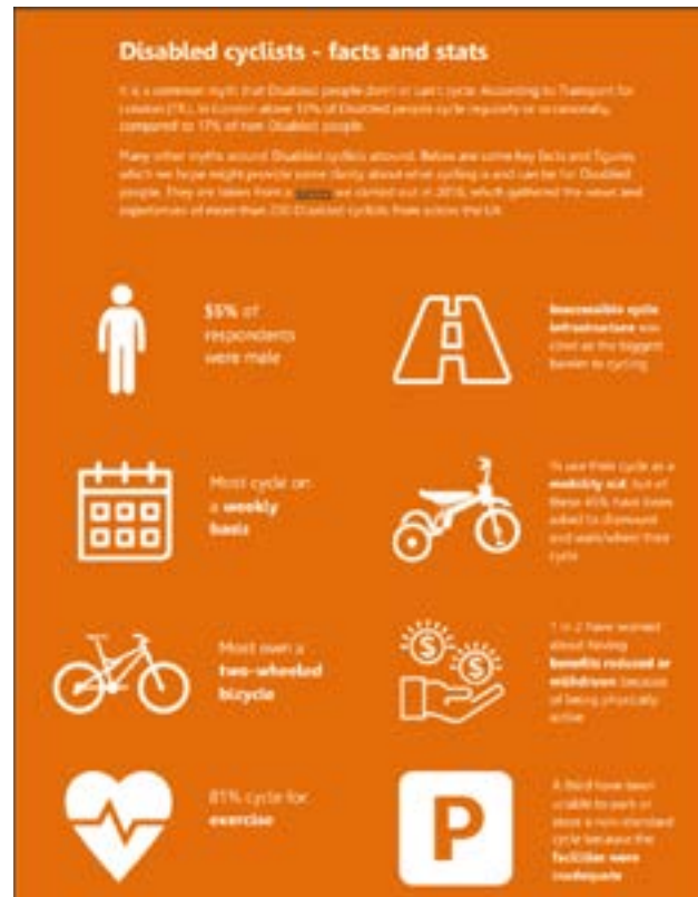
(Wheels for Wellbeing, Guide to Inclusive Cycling, 2017)

Cycle provision must be inclusive. This is a Local authority duty under the Equality Act 2010. For many people a cycle is a mobility aid, which may be a conventional or adapted cycle. Data collected by Transport for London found that the proportion of disabled Londoners who sometimes use a cycle to get around (15%) is only slightly less than for non-disabled Londoners (18%), demonstrating that cycling is an important mode of transport for everyone. (Wheels for Wellbeing, Guide to Inclusive Cycling, 2017).