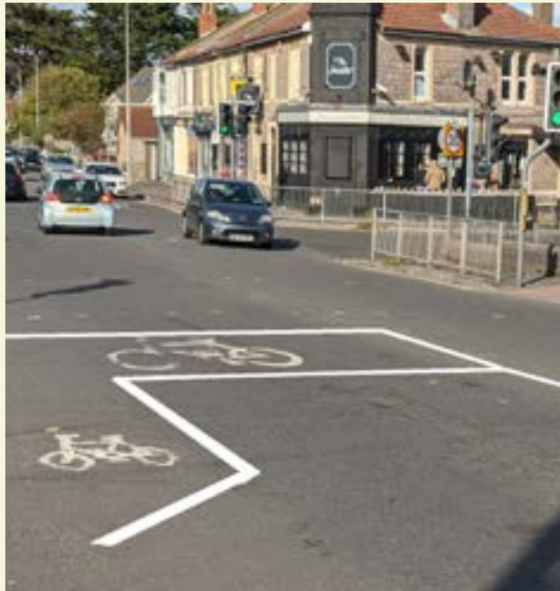
Advanced cycle stop line in Weston-super-Mare