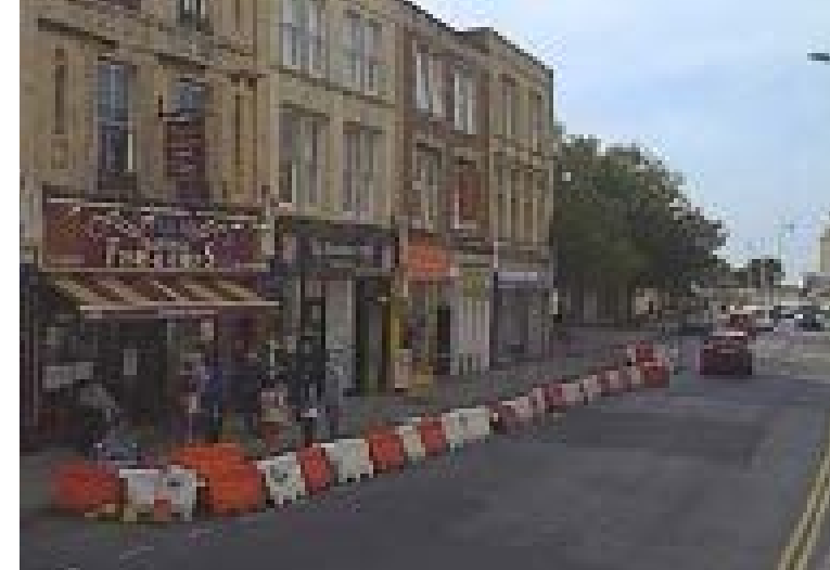
Emergency Active Travel Fund measures to support active travel and social distancing measures at busy town centre locations, such as on Waterloo Street in Weston-super-Mare

The national, regional and local stances on implementing meaningful active travel infrastructure improvements, are now more closely aligned than they have been in the past. This has meant that as of the summer of 2020, funding opportunities are increasingly tailored towards achieving meaningful alteration of the status quo of street space in favour of active travel. This has been significantly helped by the substantial increase of active travel during the COVID-19 lockdown and reopening periods, and subsequent reduction in public transport usage