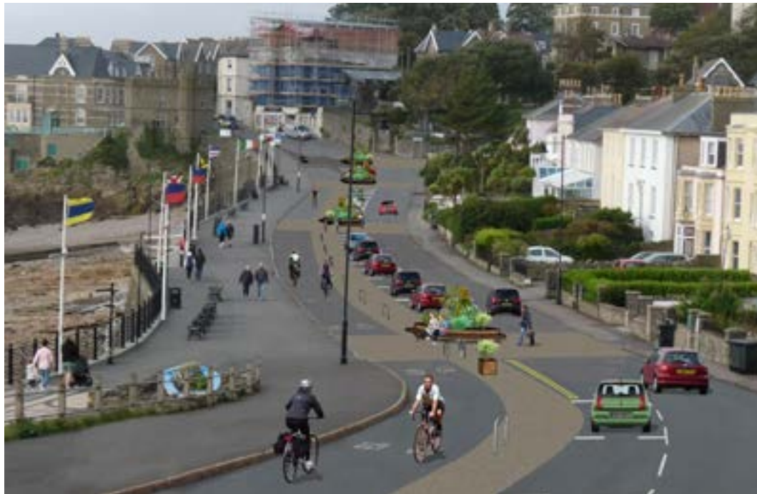
Artist's impression of The Beach at Clevedon Seafront

The scheme will link into the flagship North Somerset Coastal Towns Cycle Route as part of the strategic cycling network in North Somerset. The scheme package will improve the provision and awareness of safe walking and cycling facilities to local shops and businesses, reduce private car dominance of this popular seafront space and improve road safety perception. The overcoming of these short-term challenges will help North Somerset Council achieve strong progress against the wider challenges of public health, carbon reduction and the car-dependency and congestion culture.