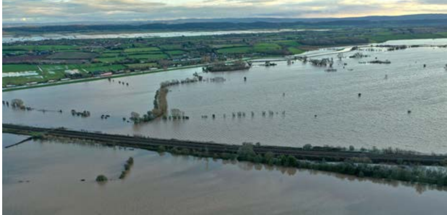
The Somerset Levels flooding in January 2014 flooded the London and Exeter main railway line (pictured) and local roads and paths leaving thousands cut off. Extreme weather events like this are expected to become more common with climate change.

As warned by the United Nations' Intergovernmental Panel on Climate Change (IPCC), we will require rapid, far-reaching and unprecedented changes in all aspects of society to avoid a rise in temperatures of just 1.5 degrees, which could lead to ecological, environmental and humanitarian disaster. This is especially true for the transport sector which, at 32%, is the largest single source of carbon emissions in the South West. For the West of